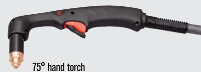
75° hand torch

(for more torch options, see www.hypertherm.com )