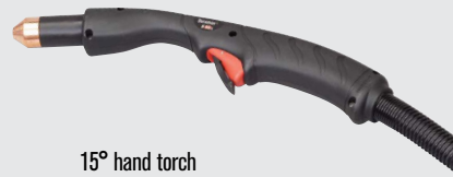
15° hand torch